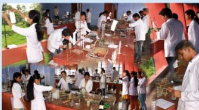
Striving for academic excellence