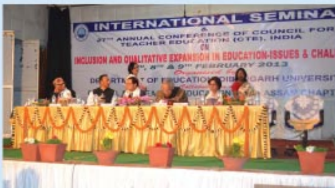
International Seminar organized by the Dept. of Education.