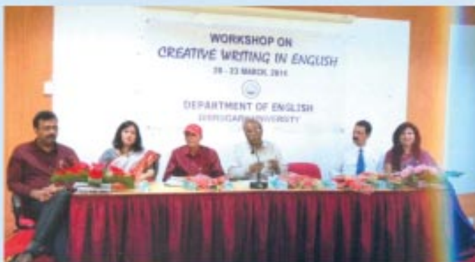
Workshop on Creative Writing in English