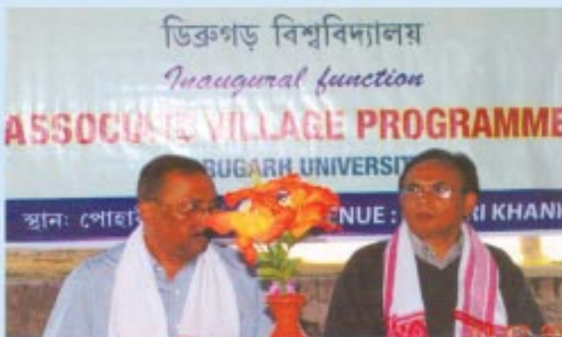
Dibrugarh University embraced a nearby village as an 'Associate Village'