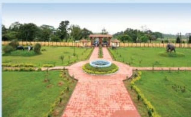
Dibrugarh University Park