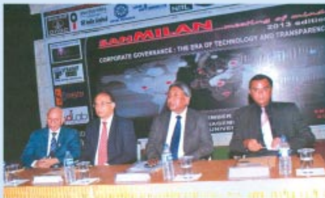
CMS Observes Sanmilan 2013