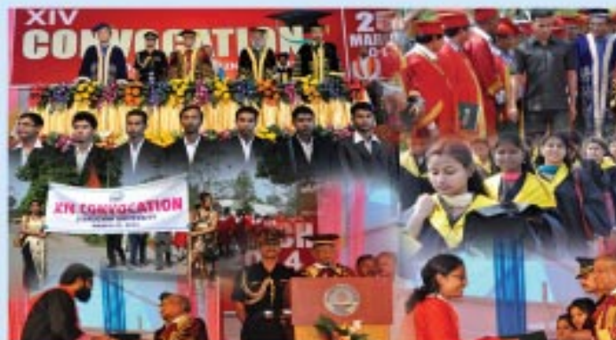
14 th Convocation, Dibrugarh University, 2014