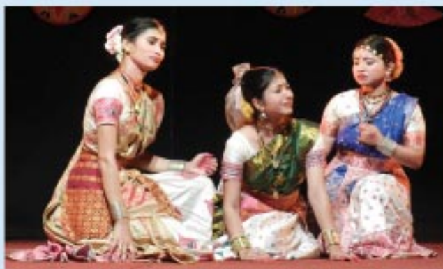
Students performing in the Cultural Programme