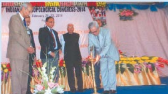
Eleventh Indian Anthropological Congress 2014 at Dibrugarh University