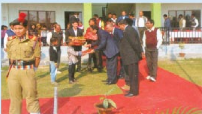
Vice-Chancellor Distributing School bag among needy children at 65th Republic Day